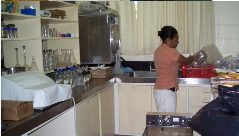
Postgraduate students at work in the Molecular Biodiscovery and Biomedicines Research Laboratory (MBBRL)